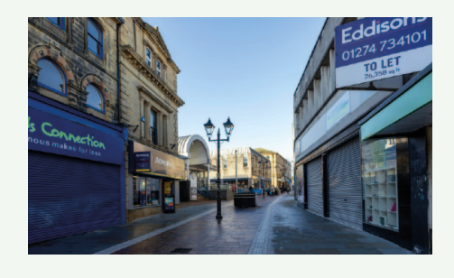
£2.39m investment Investment in town centre and infrastructure improvements

Development of industrial units and the use of brownfield sites including Providence Park and Beechcliffe