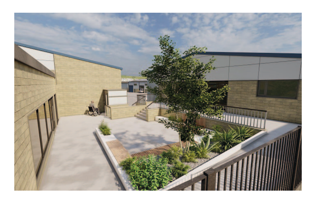
£3m investment Manufacturing, Engineering and Future Technologies Hub