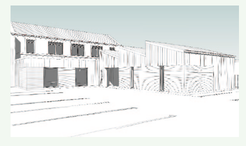
£0.16m investment Women Employment Programme