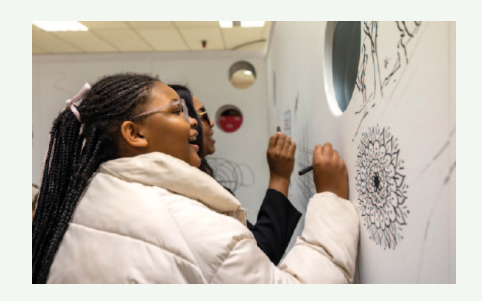
£2.6m investment Creative Arts Hub