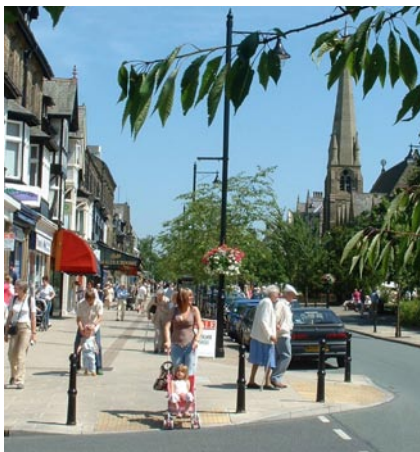
This corner building has been designed to provide natural surveillance over both of the streets it faces on to.

The principles of planning for crime prevention should not be employed to promote the security of private spaces at the expense of the security of public spaces. For example, high walls, inward facing buildings and a single controlled access to the site may make a property secure on the inside, but can make the street outside seem forlorn and even threatening. Successful streets and neighbourhoods achieve a balance between the security of private and public spaces, benefiting both the private individual and the wider population.