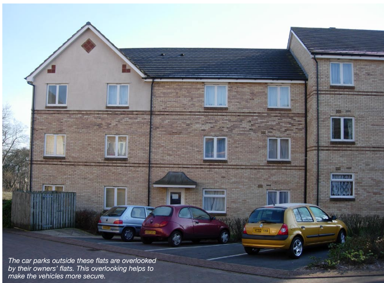
The car parks outside these flats are overlooked by their owners' flats. This overlooking helps to make the vehicles more secure.

● In security terms, the best parking is off-street, where the parking is secure and on-site. This means that vehicles are parked indoors, where the entrances can be made physically secure, and