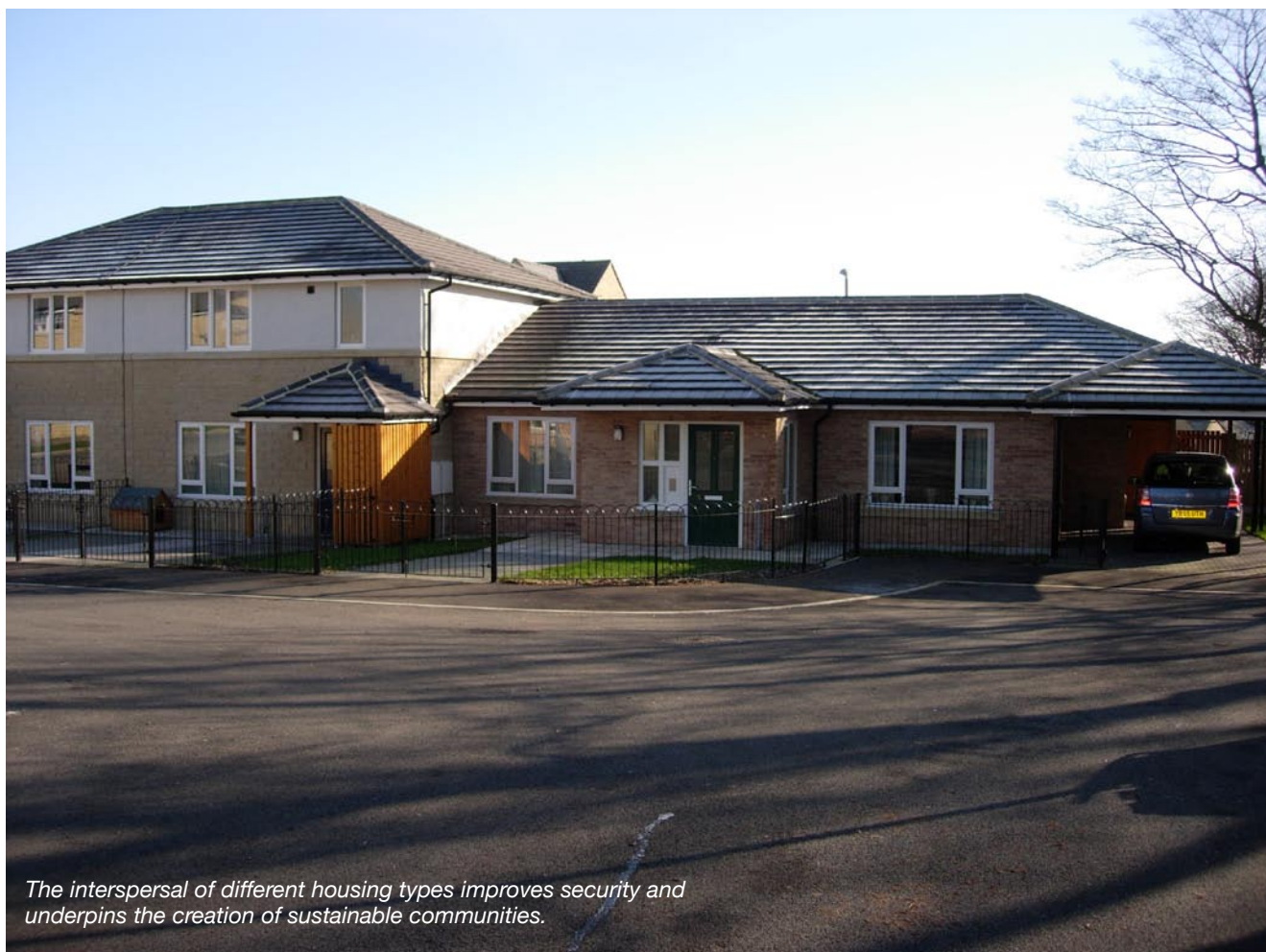
The interspersal of different housing types improves security and underpins the creation of sustainable communities.