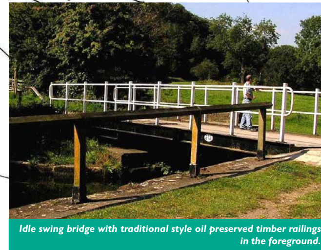
Idle swing bridge with traditional style oil preserved timber railings in the foreground.