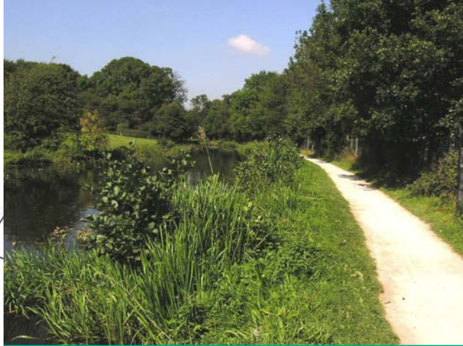
Vista of the predominantly wooded area to the north of Idle Swing Bridge.