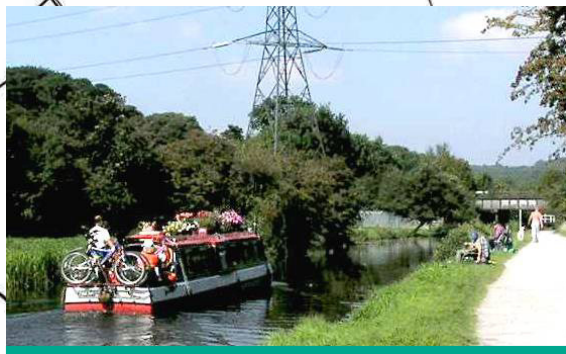
This stretch of canal is popular with anglers, boaters and walkers alike.