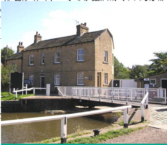
Lock House (key unlisted building).