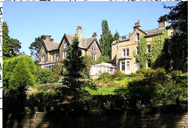
Loch Leven, Sunny Mount and Elmfield, Bromley Road (key unlisted buildings).