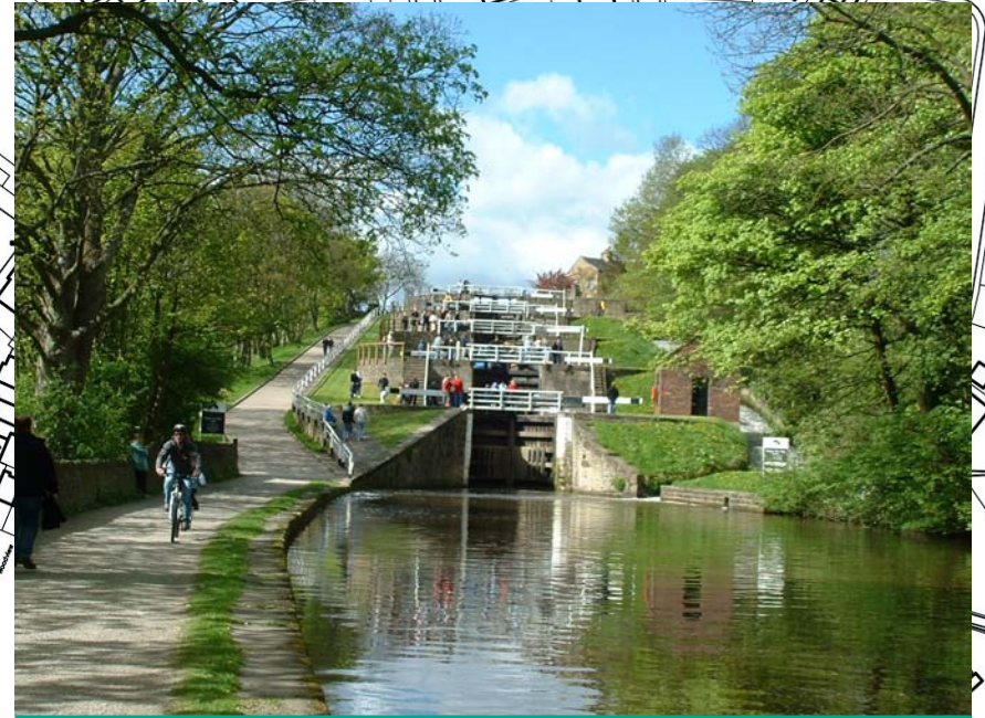
Bingley Five Rise Locks (Grade I Listed).