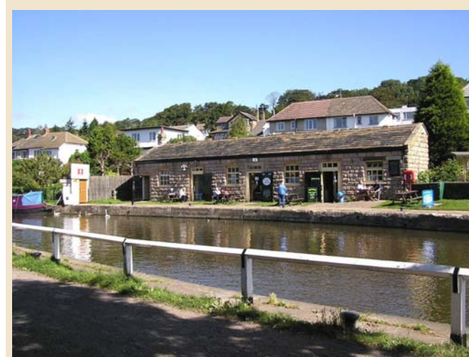
Top: 2-3 Lock Cottages. Middle: Ash Ghyll, Bromley Road (key unlisted building). Lower: The former stables at the top of Five Rise Locks are now a cafe.