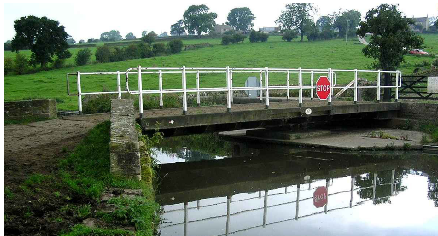
Top: The open fields and the topography of Airedale means that there are long distance views across the valley.