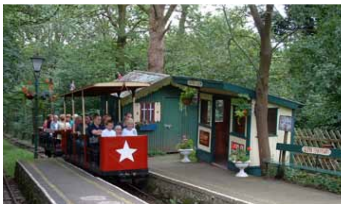
Shipley Glen Tramway