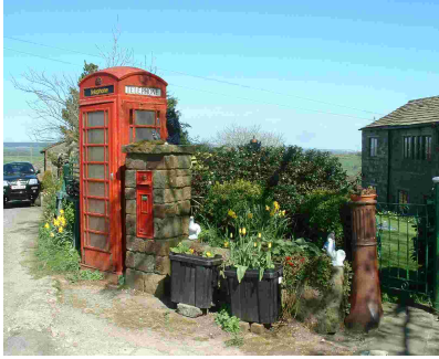
At Broad Head Farm