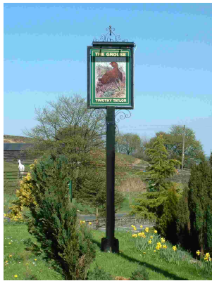
Grouse Inn Public House