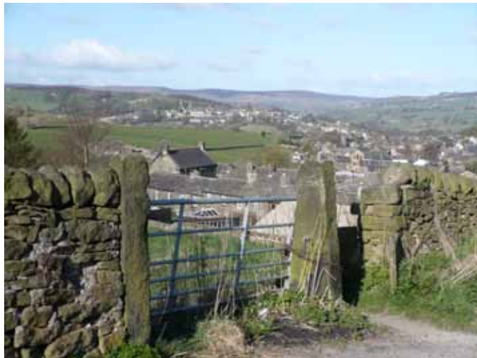
A view across to Haworth from Barcroft

Starting with your back to the park entrance turn left uphill the short distance to the main A629 road junction at the top, cross this busy road via the traffic island turning right on the opposite side, then immediately left to walk up the much quieter Bingley Road. On reaching the road junction at the top of the steep climb, cross Bingley Road straight ahead to join a footpath through the stone built stile adjacent to the gable end of 'Lane End' the row of cottages opposite.