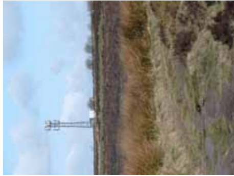
Landmark telephone mast on Harden Moor