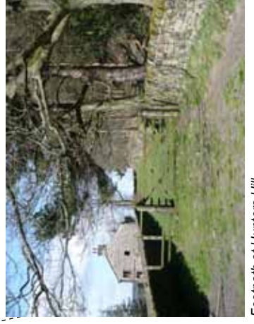
Footpath at Hunters Hill