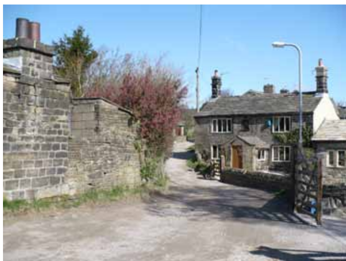
The hamlet of Ryecroft

Immediately over the stile the path divides, here our route takes the left fork following the level path straight ahead keeping near to the wall on your left until you reach a stile through a stone wall which leads out onto Ryecroft road. Take care here as you cross the road bearing slightly to your right to join the rough road opposite which leads into the hamlet of Ryecroft. Continue straight ahead along the road as meanders through the hamlet bearing left at the far end as you pass along the back of Ryecroft farm to exit Ryecroft along a farm track. After only a short distance and adjacent to the new houses on your right, leave the track via the narrow gateway on your left which leads uphill into the woodland following the well worn path between the trees which leads to a gap stile through the boundary wall of Harden moor.