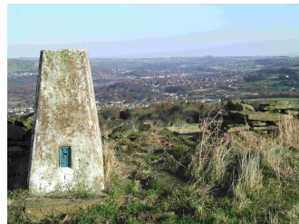
Trig Point at Norr Hill