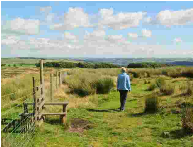
Path near Brass Castle