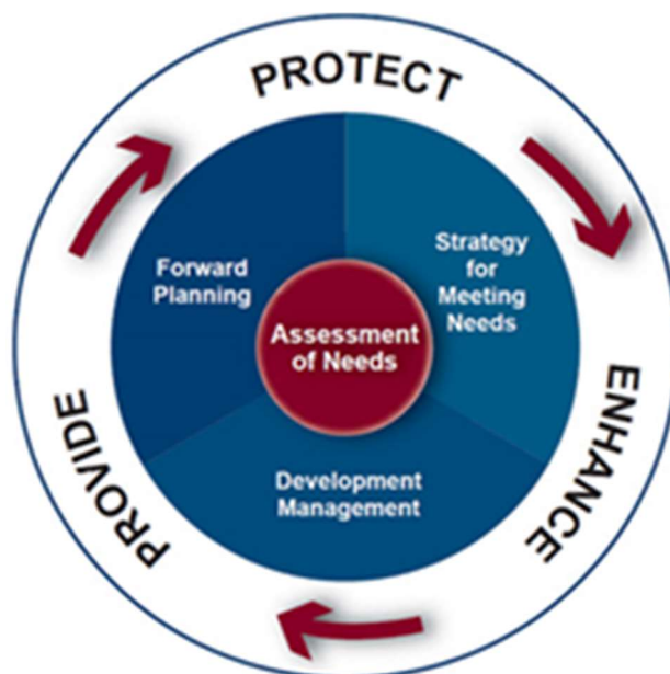
Figure 1: Sport England themes

To provide new pitches and ancillary facilities where there is current or future demand to do so.