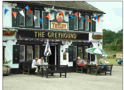
Public house near to the walk start point