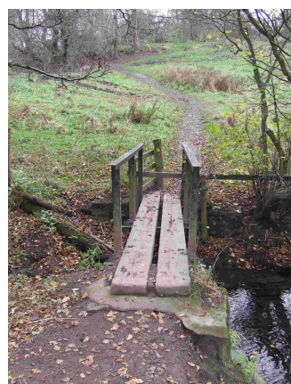
Footbridge - Cockersdale